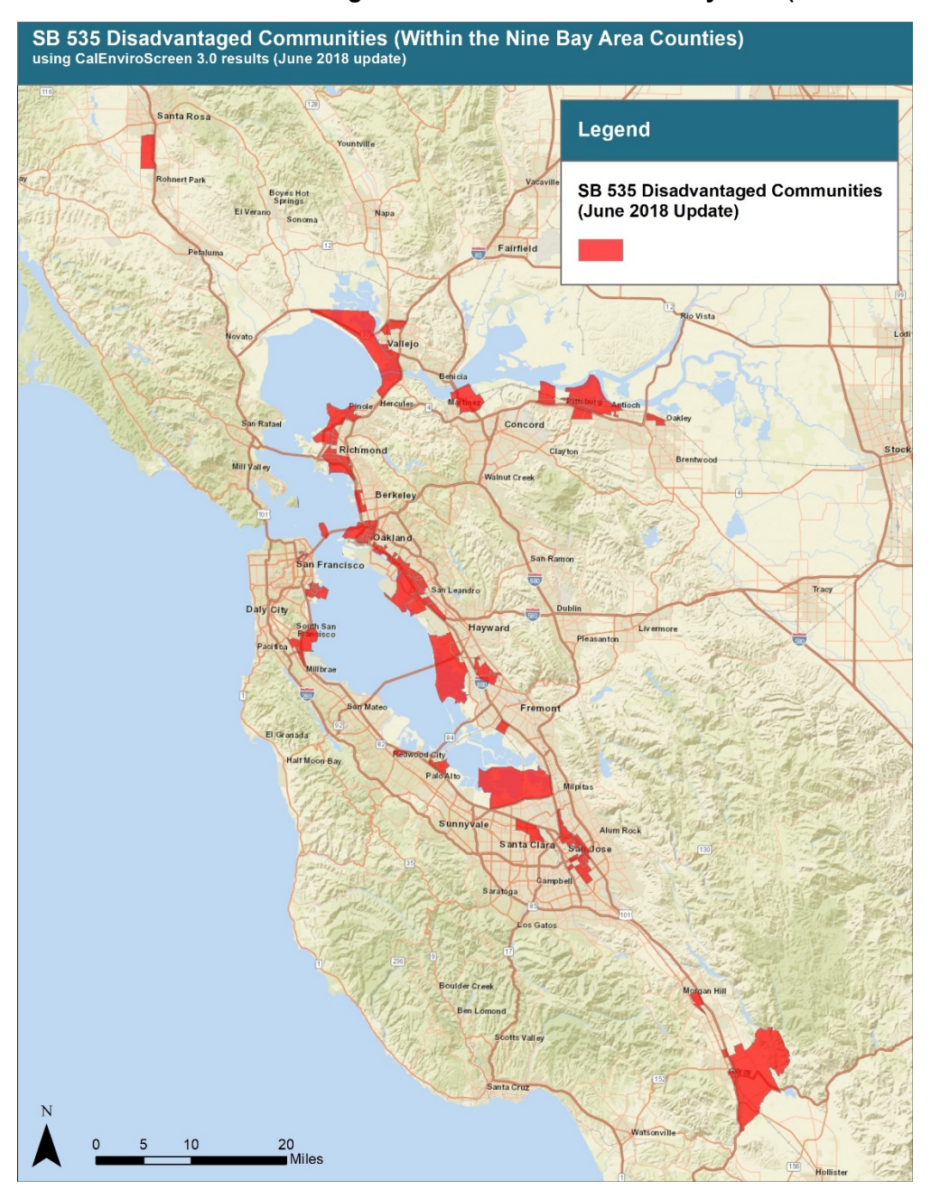
Exhibit 7: SB 535 Disadvantaged Communities within the Bay Area (June 2018 Update)

535, along with other areas with high amounts of pollution and low populations specifically within the nine Bay Area counties. More information is available at: <a href="https://oehha.ca.gov/calenviroscreen/sb535">https://oehha.ca.gov/calenviroscreen/sb535</a>.