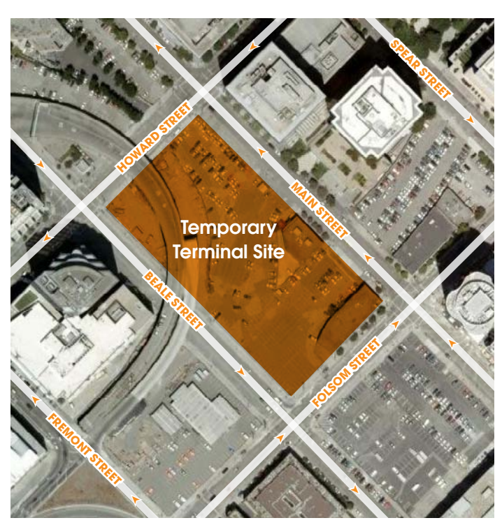
Map of Project Area +

The Transbay Joint Powers Authority (TJPA) continues to make exciting progress toward building the Transbay Transit Center, the "Grand Central of the West." Groundbreaking commenced in December 2008 for the Temporary Terminal that will serve bus passengers while the new Transit Center is under construction.