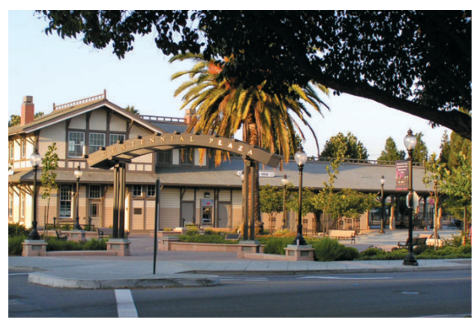
Mountain View's Caltrain Station is designed for multiple types of uses.

Since the mid-1990's, the City of San Mateo and its citizens have been engaged in developing and fine-tuning a vision for successful transit-oriented development (TOD) around the city's major transit stations. In this vision, pedestrian-friendly neighborhoods and employment centers are conveniently located in proximity to transit and interwoven harmoniously into neighborhoods that surround it. Local businesses provide residents and office-workers a variety of goods and services within a short walking distance. Residents and workers walk, bike, or take public transit to their destinations, creating a more vibrant and active streetscape and reducing dependency on automobile transportation. For the area surrounding the Hillsdale Caltrain Station, this vision has been carried through in several planning documents adopted by the City Council, including the Rail Corridor Plan, El Camino Real Master Plan, and the Bay Meadows Phase II Specific Plan Amendment. The Hillsdale Station Area Plan builds on and is a result of this vision, these documents, and extensive community and transit agency engagement.