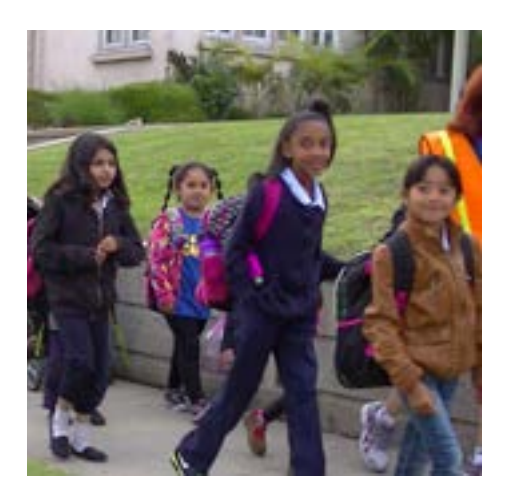
Students are much more likely to walk and bike if their personal safety is not threatened.