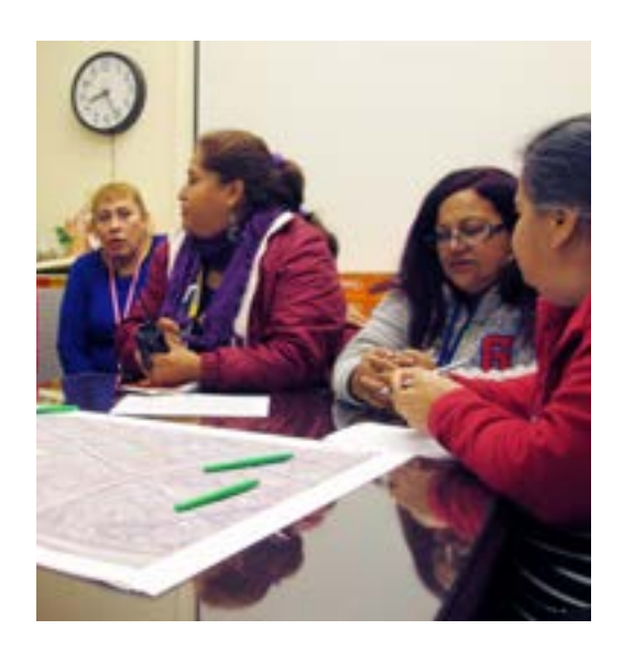
Hiring staff from within the community or partnering with community organizations encourages parents to participate.

"Turnover of school staff, principals and even student/parent populations is greater in low income schools, which makes identifying program champions/volunteers and maintaining momentum for activities challenging."