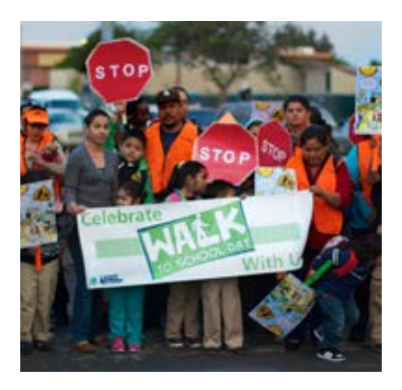
Students can join Walking School Buses and Bike Trains to safely use active modes for the school commute.