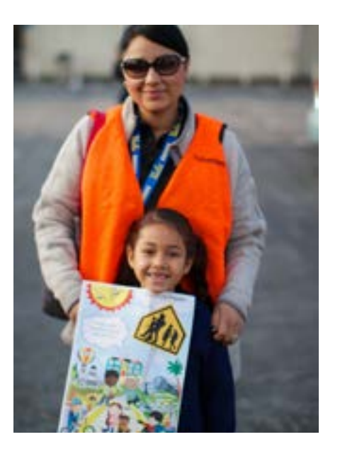
SRTS events and activities should be intentional about including all students and their families.