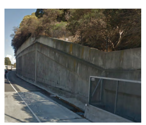
Eastbound I-580 requires widening in Contra Costa County to accommodate the third eastbound lane. The retaining wall shown must be removed and replaced with a wall set further back from I-580.