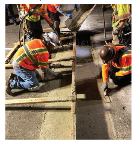
Crews finish pouring concrete for the final joint on the upper deck of the RSR Bridge.