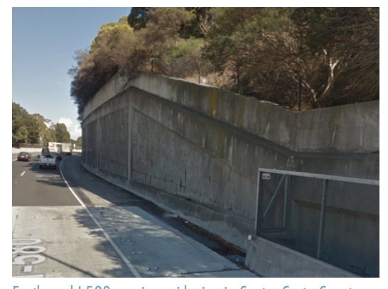
Eastbound I-580 requires widening in Contra Costa County to accommodate the third eastbound lane. The retaining wall shown must be removed and replaced with a wall set 15 feet back from I-580.