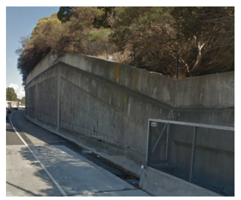
Eastbound I-580 requires widening in Contra Costa County to accommodate the third eastbound lane. The retaining wall shown must be removed and replaced with a wall set further back from I-580.