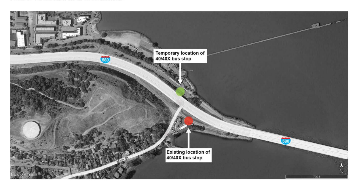
Detour Map 6