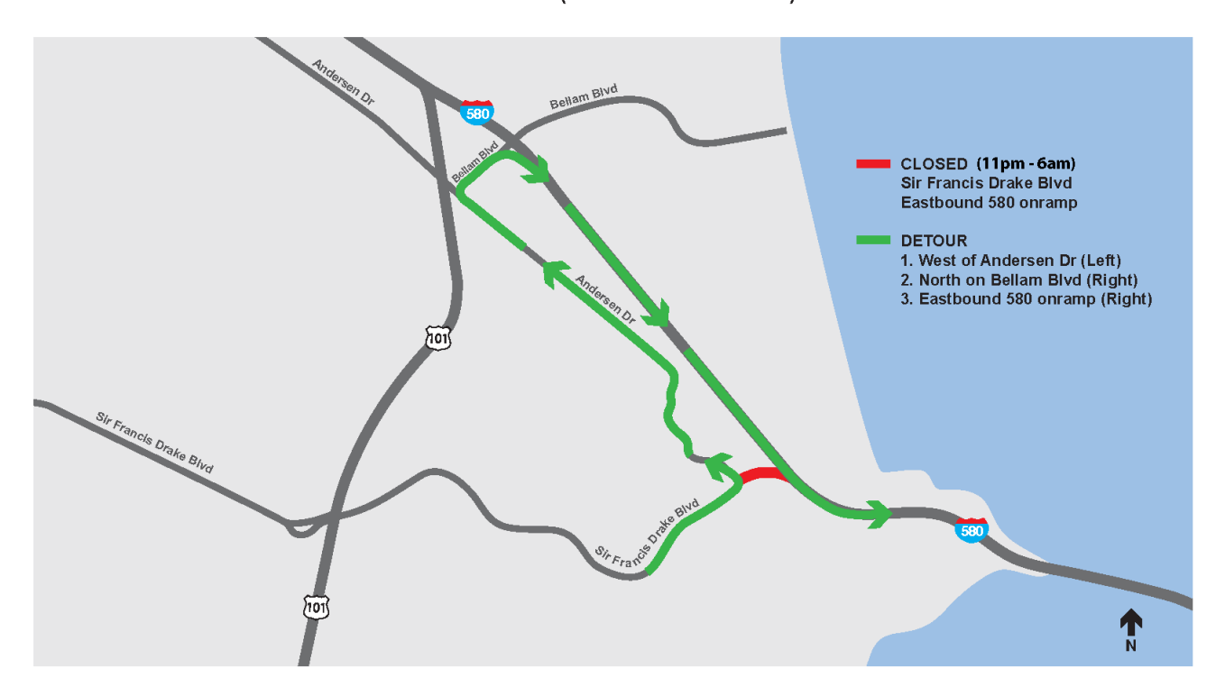
Detour Map 2

I-580 RICHMOND/SAN RAFAEL BRIDGE DETOUR MAP (EASTBOUND ONRAMP)