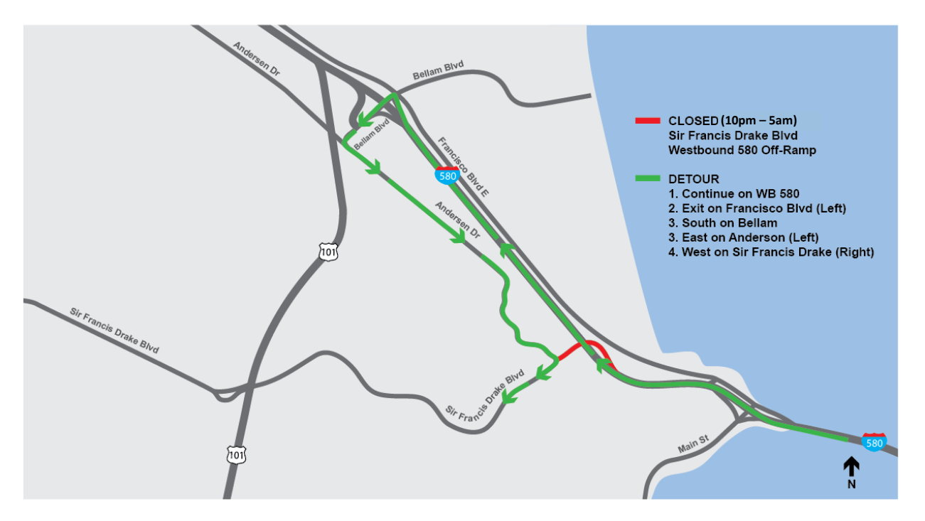
Detour Map 2