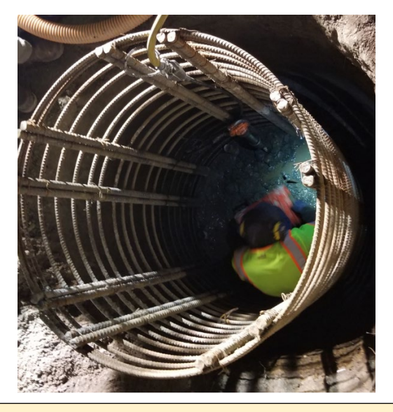
Preparing the top of the pile for sign-bridge pedestal