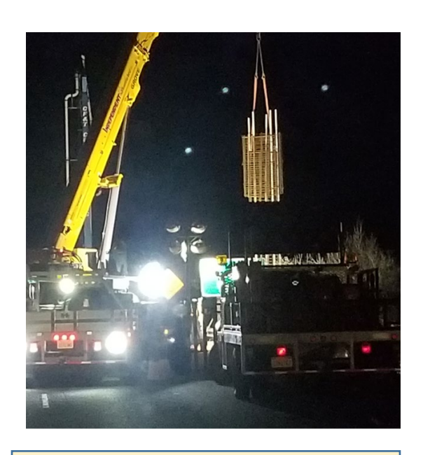
Setting reinforced steel cage for CIDH pile