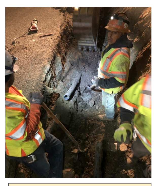
Installation of electrical conduit

If you would like to add people to our email list, or if you experience significant impacts or have questions, please contact us.