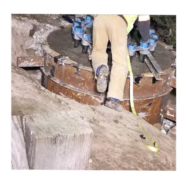
Finishing concrete on sign-bridge pedestal

If you would like to add people to our email list, or if you experience significant impacts or have questions, please contact us.