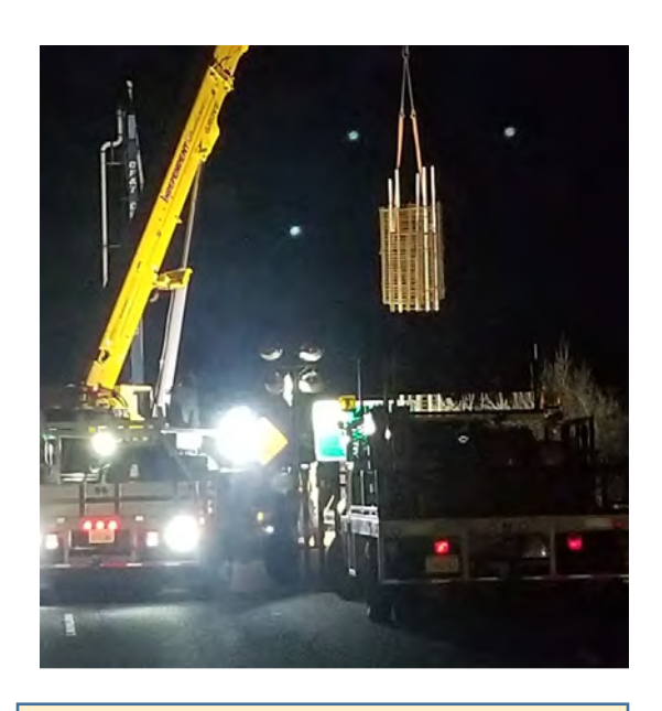
Setting reinforced steel cage for CIDH pile