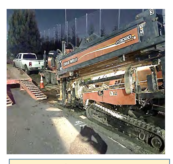
22ft. Boring Machine